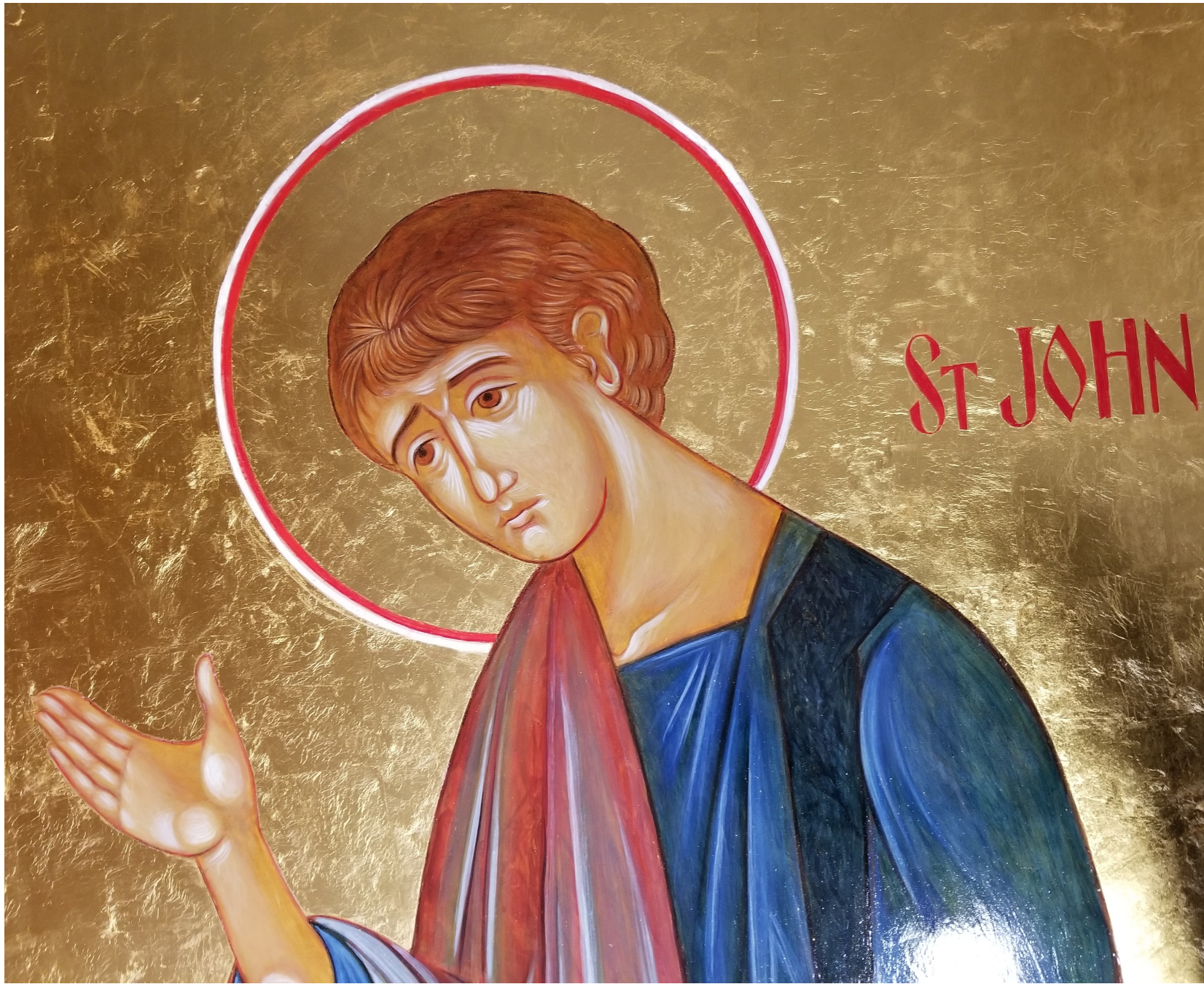
Detail St. John