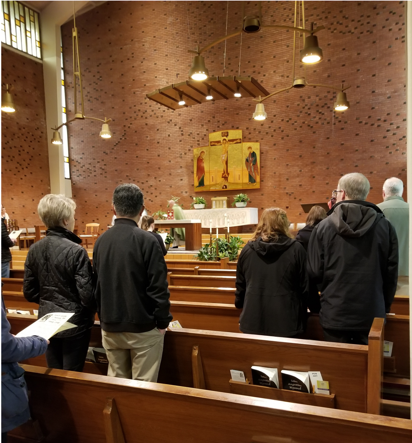
At Mass Feb. 23, 2020