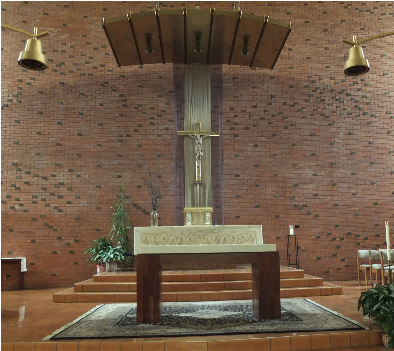
The rear marble altar, upon which the tabernacle rests, is 10 feet wide. The brick wall has a slight curve.